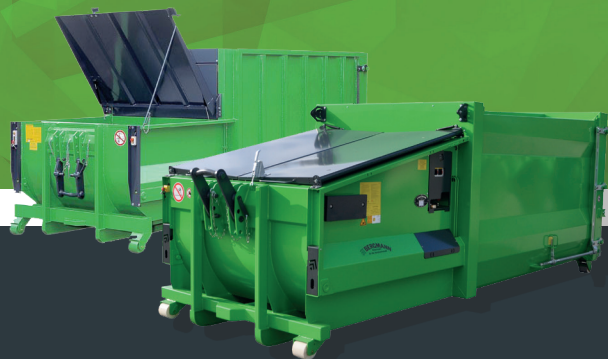
Bergmann APB 606 with pendulum roof