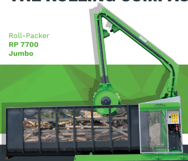
Roll-Packer RP 7700 Jumbo