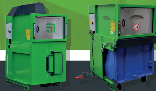
PS 1400-E with 1400-litre PE plastic bag